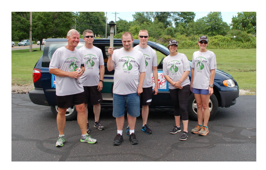
2015 Special Olympics Law Enforcement Torch Run

In 2015, Third Shift officers made 69 felony arrests and 269 misdemeanor arrests for drugs, domestic violence and a variety of other offenses. Additionally, and a top priority, Third Shift officers made 233 arrests for operating a vehicle under the influence of alcohol and/or drugs.