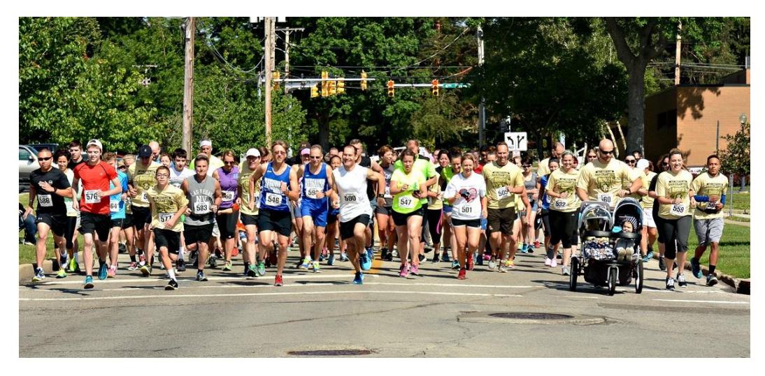
2015 Dan Crabtree Memorial Run

The Cuyahoga Falls Regional Communication Center exists to provide the citizens of Cuyahoga Falls, the Village of Silver Lake and the City of Munroe Falls an effective means by which to summons both emergency and non-emergency public safety assistance and to provide our public safety personnel with constant, reliable communications and support. The Center is a 24/7/365 operation that dispatches police, fire, EMS in response to 911 calls for service, averaging 120,000 calls per year.