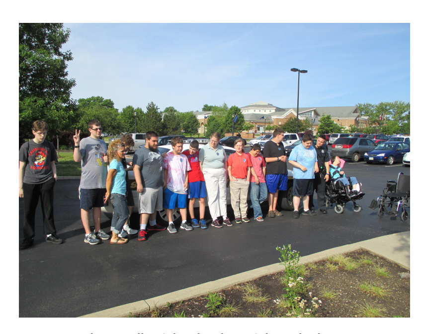
Cuyahoga Falls High School special needs class tour

Theft – A woman used her position as an employee of a social organization to gain access to approximately $40,000.00 intended for that club. Detectives charged the female with felony Theft. She received 5 years of community control and ordered to pay restitution.