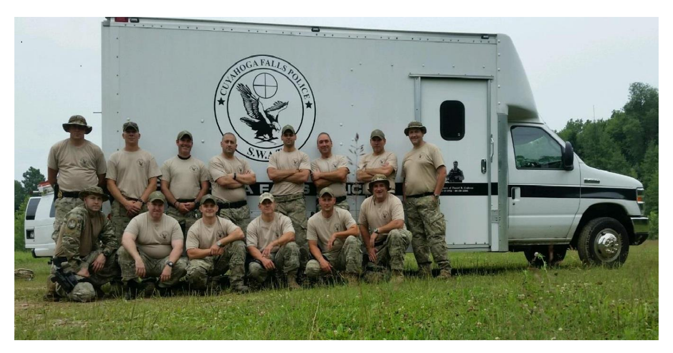
2015 CFPD SWAT Team

The SWAT team will continue to serve the department in its efforts to provide a safe environment for the citizens of Cuyahoga Falls.