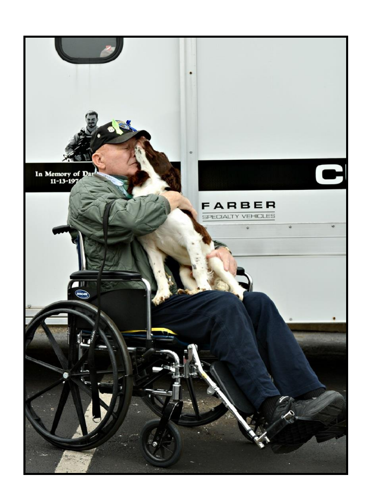
2015 Annual Report