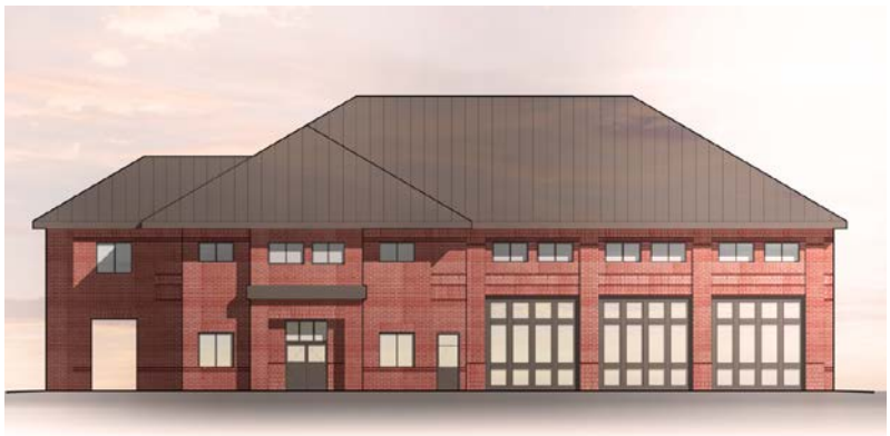
G-006 CUYAHOGA FALLS FIRE DEPARTMENT STATION No. 3 South Elevation SCALE: 1/8" = 1'-0"