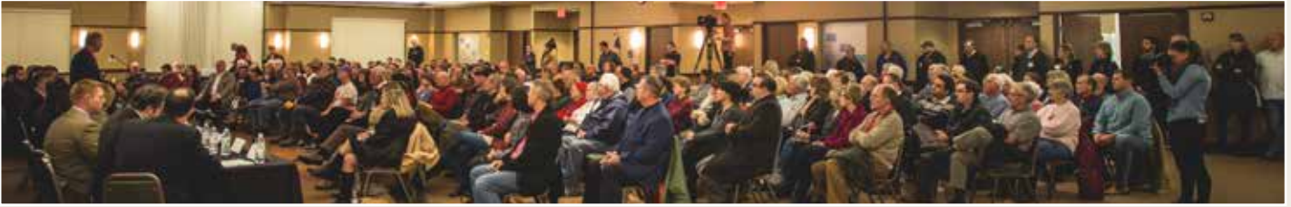
Hundreds attend a recent public forum to outline progress on the Front Street redevelopment. Below, artist renderings illustrate the concept.