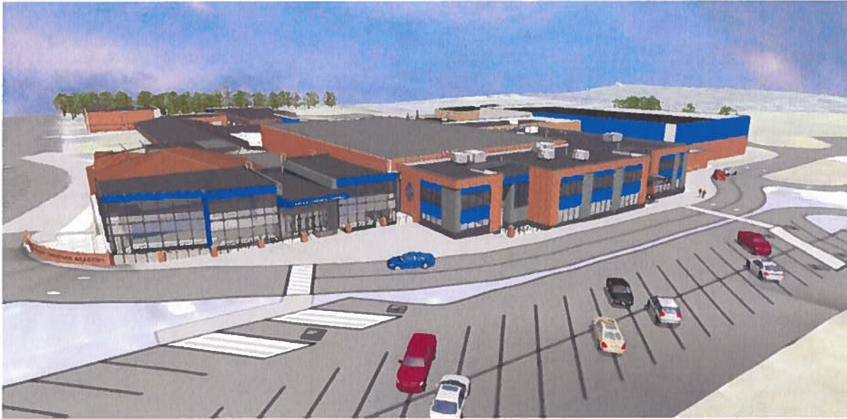
D5 Southwest Perspective SCALE: 1/92 31