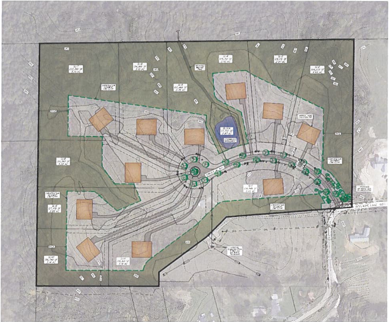
Figure 1 – Final Development Plan