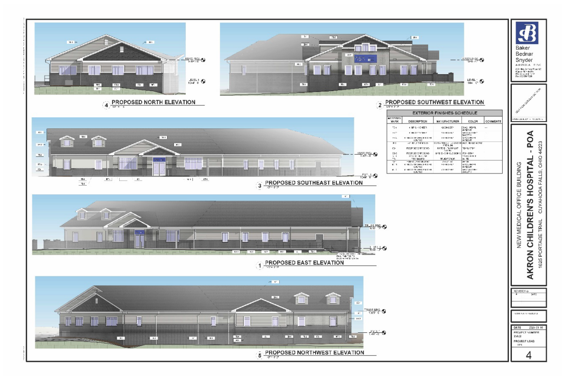
Figure 1 - Landscape Plan & Elevations (Preliminary)