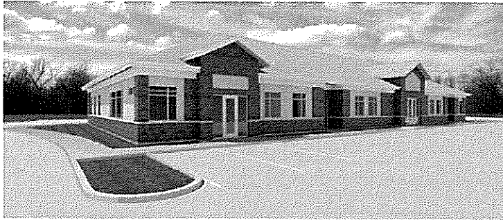
PORTAGE TRAIL OFFICE 700 WEST 100TH STREET, SUITE 100 PORTAGE, MI 49782 AUGUST 14, 2011