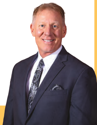
Mayor Don Walters

I wish you and your family a safe, healthy, happy, and prosperous 2024!