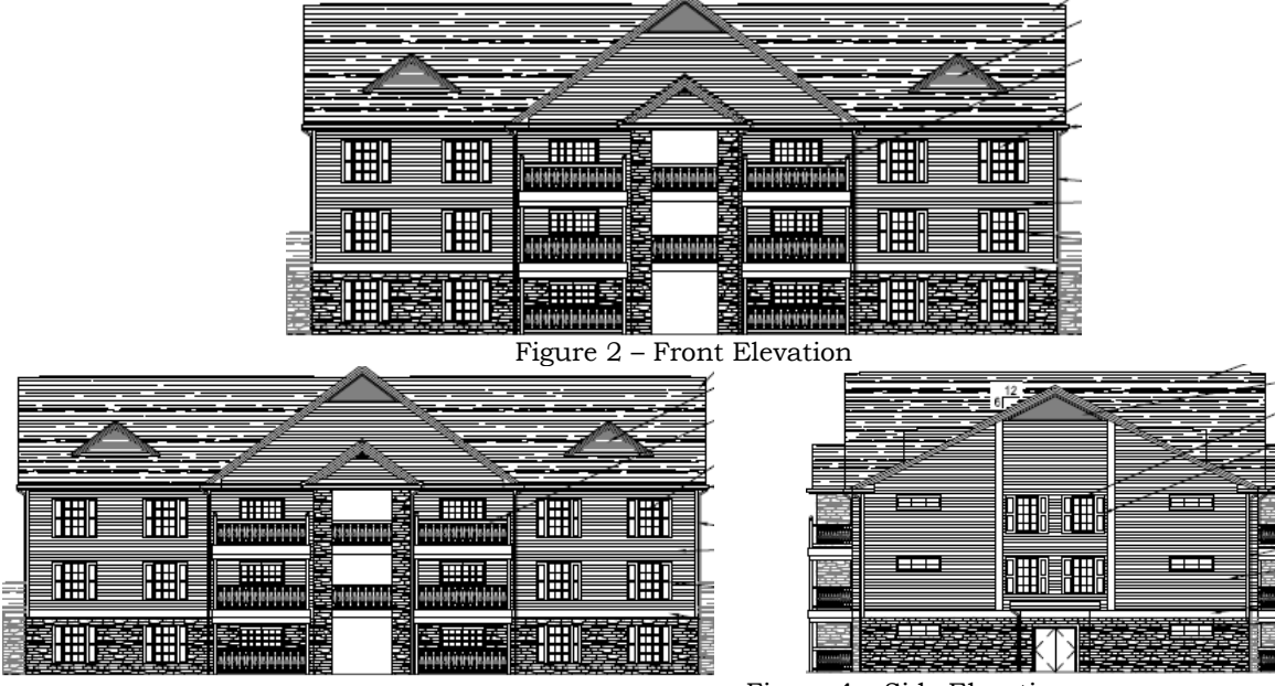
Figure 3 – Rear Elevation